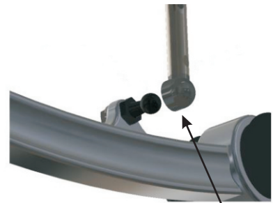
Head light sensor rod - M3 models

Contents - 2x Control arms - with spherical bearings