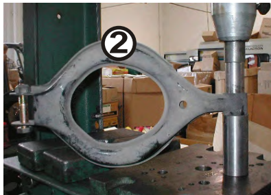
Disk-type emergency brake Knuckle with stud at shock position (b)

Bushing Installation: Make sure there are no sharp metal edges, apply grease to bushings, sleeves, and ID's of arms and knuckle. Refer to parts list for proper locations. Press in bushings first, then press in sleeves. Make sure when installing #8317 that you install it half way first (7) , then align the cut out parallel with the studs in the lower shock clevis (8) . Installation of suspension is reverse of removal. Tighten all bolts to factory specifications.