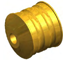
15.10.465.39 Sleeve x 2