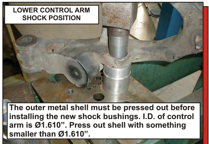
LOWER CONTROL ARM SHOCK POSITION

To remove cap washers on upper control arm, clamp cap washer in vice and wiggle arm back and forth. Inner sleeve is not bonded, use spray lube to help press it out.