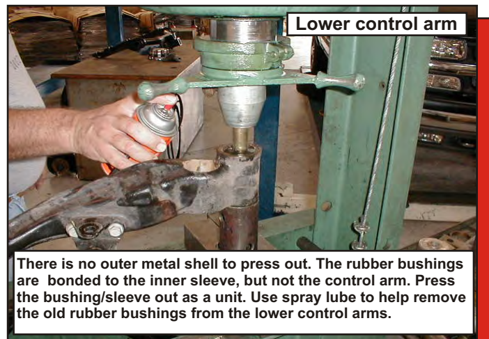
Lower control arm

After inner sleeve has been removed, pry out old bushing. Make sure inside surfaces are free of all old bushing material and sharp edges. Coat urethane bushing, sleeve and shell I.D. with supplied grease. (all surfaces of bushings that contact metal). Inner sleeve and cap washer must be reused.