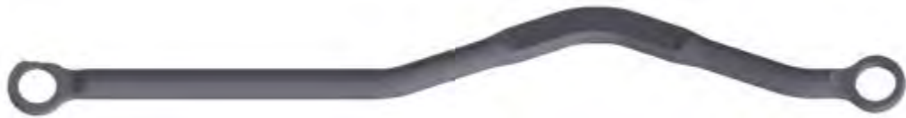
Track bar frame end