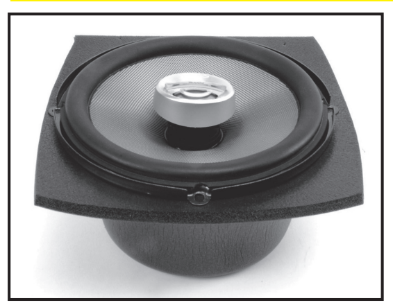
Fig 1 - Test fit speaker into baffle

NOTE OF CAUTION: Wear eye and hand protection when installing all materials.