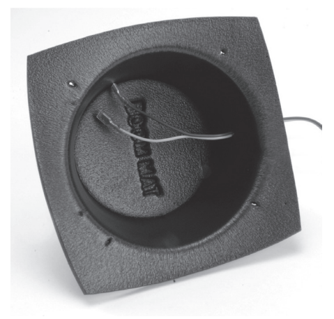
Fig 3 - Run speaker wire through small hole