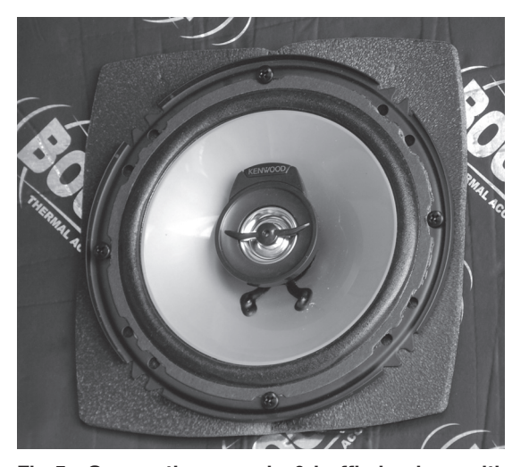
Fig 5 - Secure the speaekr & baffle in place with original mounting screws