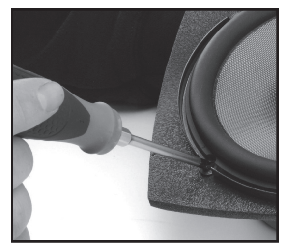
Fig 4 - Make small holes for mounting screws