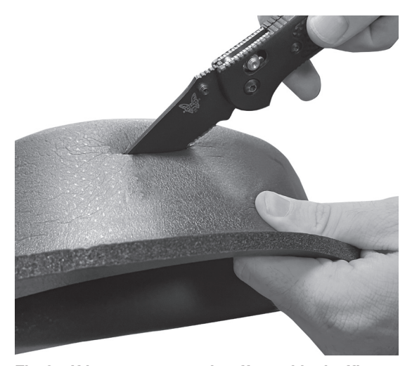
Fig 6 - If bass response is affected by baffle, cut a hole in the bottom side of the baffle to allow air flow for bass.

STEP 4. Using an Awl or point tool, push through the mounting screw holes to make small holes in the baffle. FIG 4