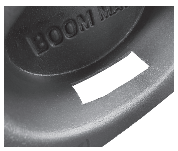
Fig 7 - Cut hole in the side of the baffle that will be facing down when it is installed.

Before covering the speaker, test the sound quality. In some cases the base response can be affected, if this happens you can do a simple procedure and port, or cut a hole in the baffle to allow air movement. Do this on the bottom side of the baffle. This will allow the baffle to still protect the speaker, but allow air movement for the bass response. FIG 6 & FIG 7