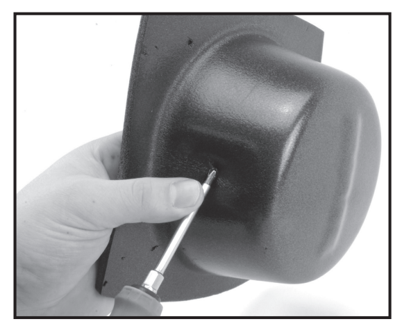
Fig 2 - Make small hole to run speaker wire through

STEP 3. Make a hole or slit to run the speaker wires. Use silicone sealant around the wires to make a good seal. FIG 2 & FIG 3