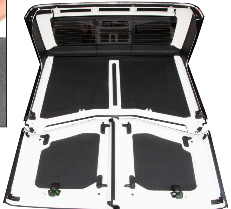
Completed installation with top inverted

11.) Reinstall the hardtop according to the manufacturer's suggested installation.