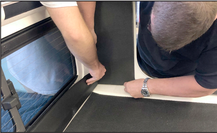
Figure 10. Pull small portion of release liner and line up large section