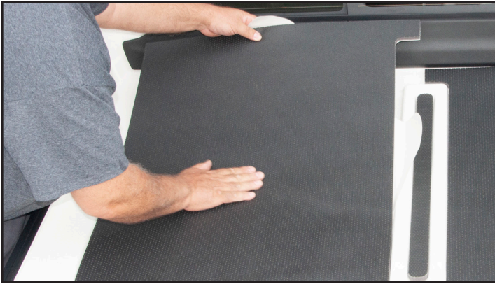
Figure 9. Pull backer off while applying gentle pressure