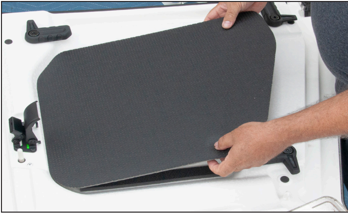
Figure 5. Lay panel in place by applying gentle pressure