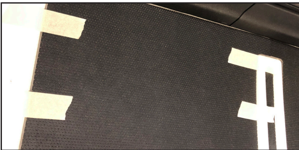
Figure 7. Tape rear section into place