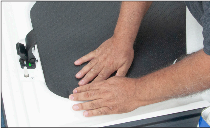
Figure 6. Apply pressure by hand for proper adhesion