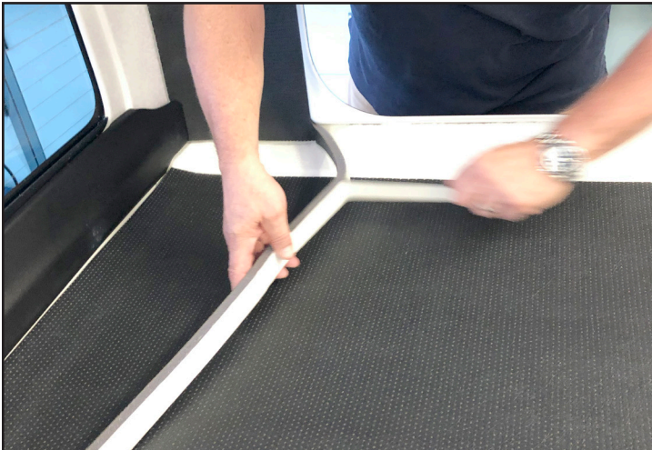
Figure 11. Peel the rest of the release liner off narrow section and press into place.

9.) Locate the side window liners. The release liner is slit to help in installation. Peel a two inch portion of the release liner away from the wider portion of the liner. Have someone hold the black trim away from the top and then slide the liner into place making sure to align with the edge of the top. (Figure 10) Once in place remove the rest of the release liner and stick into place. Then remove the release liner from the narrow strip and stick in place being careful not to stretch the foam. (Figure 11) Repeat for other side.