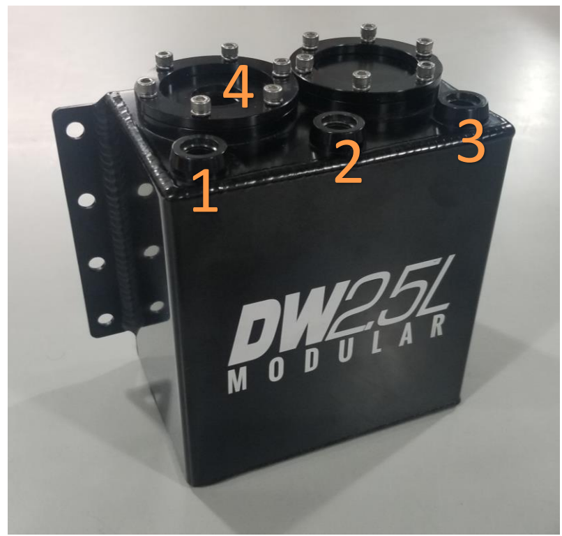
*all outlets/inlets are -6 AN ORB except for the p/u tube outlet. The p/u tube outlet is -10 AN ORB.

For additional technical support please contact us at: <u>TechSupport@Deatschwerks.com</u> or 405.233.3991