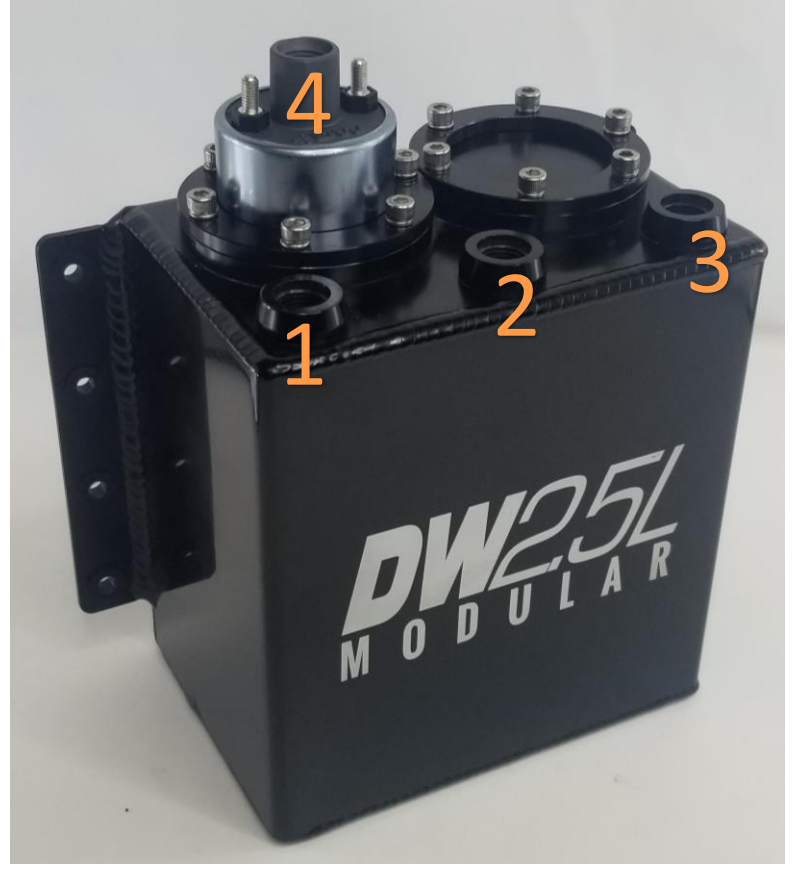
*all outlets/inlets are -6 AN ORB.