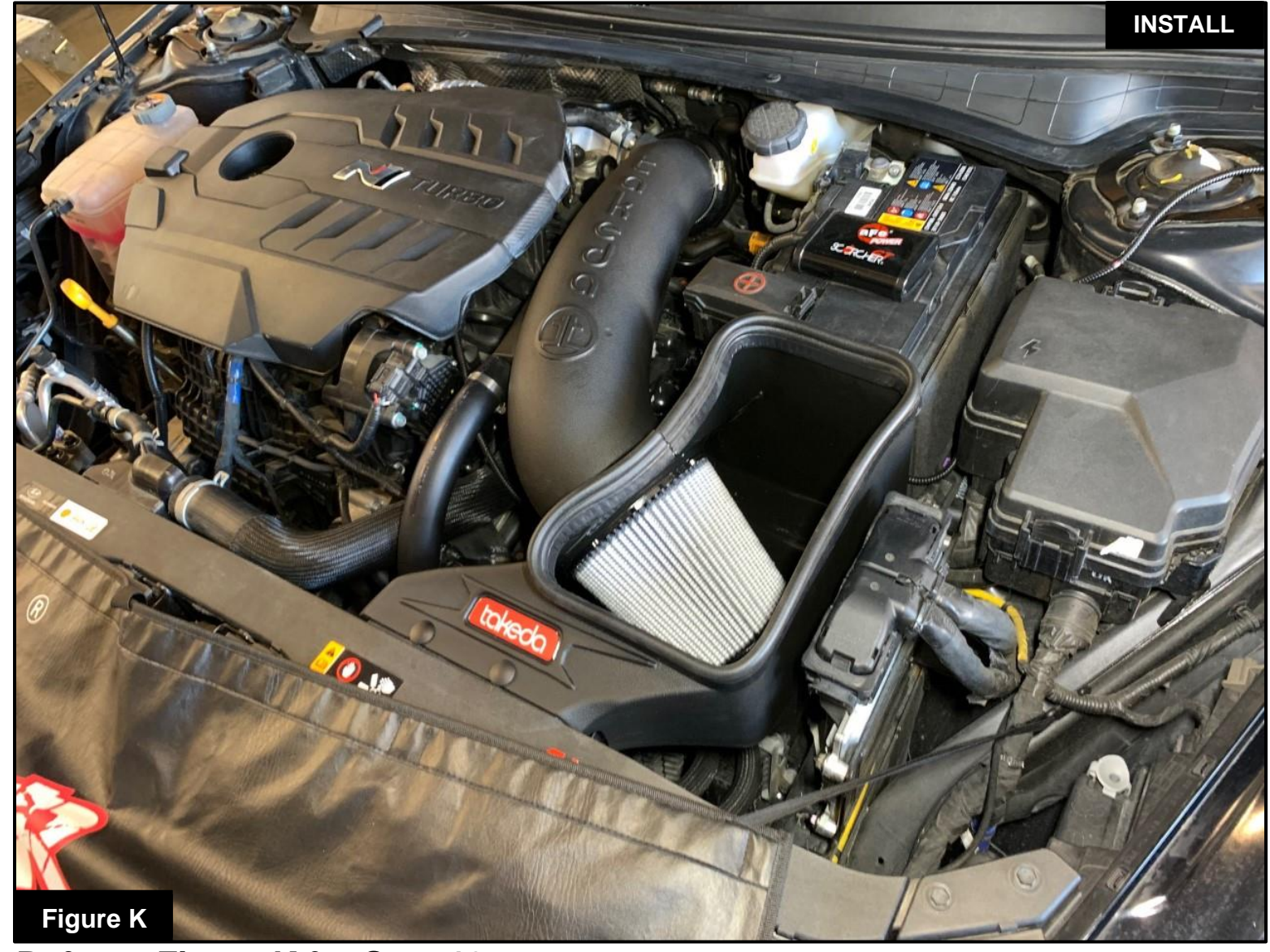
Refer to Figure K for Step 19

Step 19: Make sure all clamps and connections are secured. Your installation is now complete. Thank you for choosing Takeda USA!