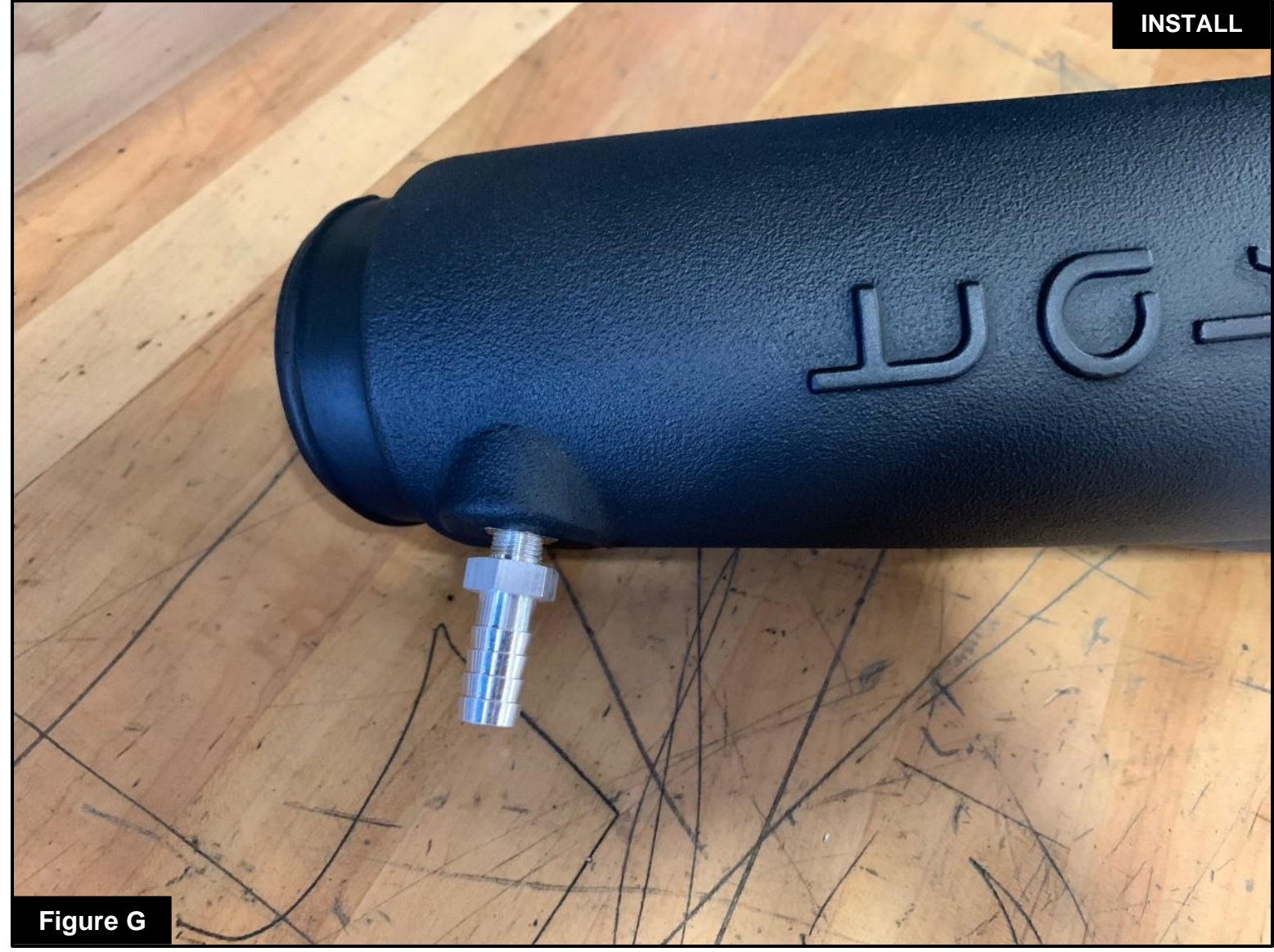
Refer to Figure G for Step 13

Step 13: Using a 16mm wrench, install the aluminum fitting into the Takeda air intake tube.