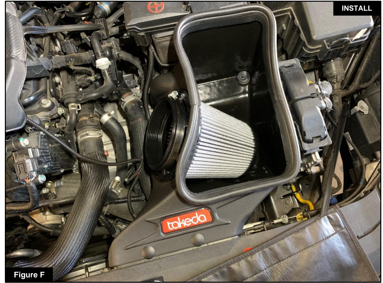
Refer to Figure F for Step 12