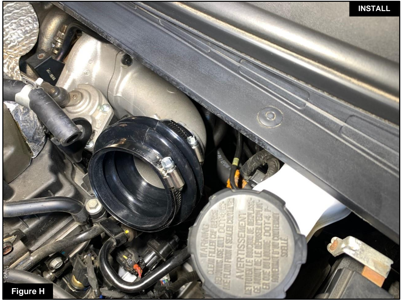
Refer to Figure H for Step 14