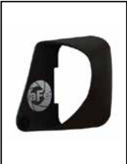
Dynamic Air Scoop