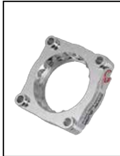
Throttle Body Spacer