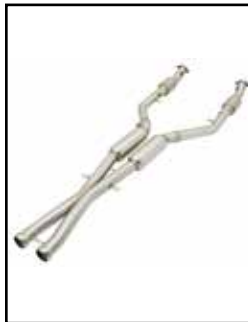
Mid Pipe/X-Pipe Exhaust

P/N: 49-36321 (w/ Reson.) 49-36316 (No Reson.)