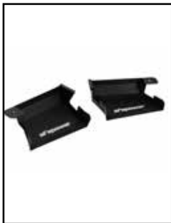
Dynamic Air Scoops