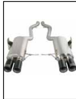
(4 Door) Cat-Back Exhaust

P/N: 49-36311-P (Pol. Tips) 49-36311-C (C/F Tips)