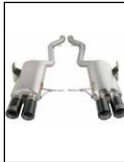
(2 Door) Cat-Back Exhaust

P/N: 49-36312-P (Pol. Tips) 49-36312-C (C/F Tips)