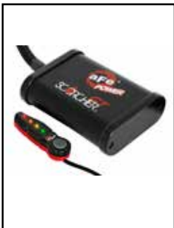
SCORCHER GT Module