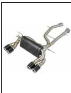
Axle-Back Exhaust System

P/N: 49-36338-C (C/F Tips) 49-36338-P (Pol Tips)