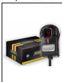
Sprint Booster V3

P/N: 49-36338-C (C/F Tips) 49-36338-P (Pol Tips)