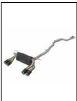
DP-Back Exhaust System

P/N: 49-36337-C (C/F Tips) 49-36337-P (Pol Tips)