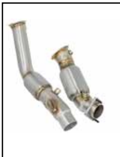
Twisted Steel Downpipes

P/N: 48-36312-1 (Street) 48-36313 (Race)