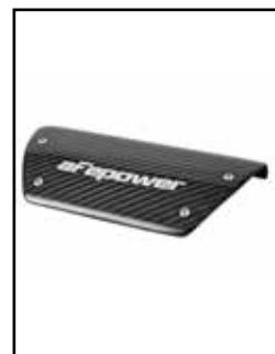
Carbon Fiber tube cover