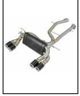
P/N: 49-36338-C (C/F Tips)