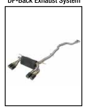
P/N: 49-36337-C (C/F Tips)