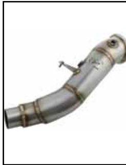
Twisted Steel Header