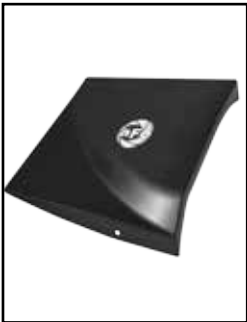
Cover Kit Stage 2