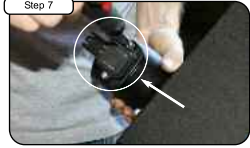
Step 7 Install MAF sensor using gasket and #8-32 screws provided. Tighten using flat head screwdriver.