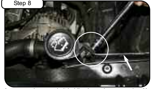
Step 8 Loosen and remove bolt holding in washer reservoir with 10mm socket or wrench. Save bolt for later install (See step 10).