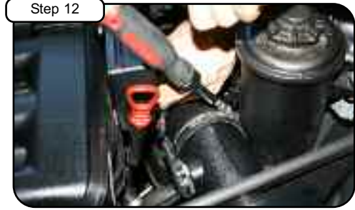
Step 12 Attach stock tube to intake. Pull stock tube, hold, and tighten clamp using 1/4" nut driver. Connect MAF sensor harness.