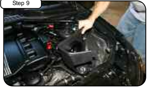
Step 9 Attach trim seal to housing. Install housing into vehicle and position.