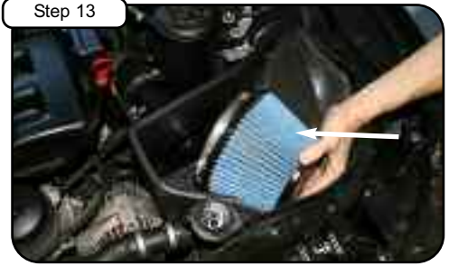
Step 13 Install air filter and tighten using 5/16" nut driver.