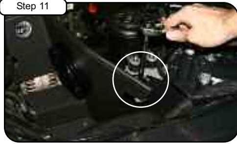
Step 11 With bolt from step 4A, tighten down housing using 10mm socket or wrench.