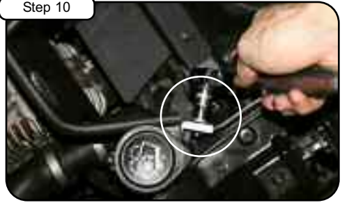
Step 10 Secure housing using bolt from step 8 and tighten using 10mm socket or wrench.