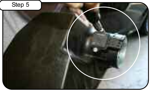
Step 5 Carefully remove MAF sensor using T25 torx bit.