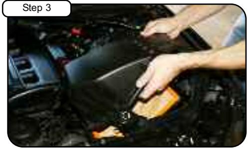
Step 3 Unclip upper half of air box to remove lid and filter.