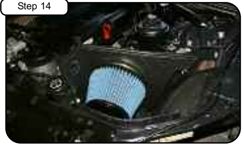
Step 14 Place enclosed CARB EO sticker on a clean/smooth surface on or near the intake system. EO identification label is required in passing the Smog Check Inspection. Your installation is now complete. Please check all clamps and hoses periodically and tighten. Thank you for choosing aFe!

Note: Filter Cleaning and Re-oiling: When cleaning your aFe filter, be sure to use only aFe's "Restore Kit" (aFe P/N: 90-50001 blue oil aerosol, aFe P/N: 90-50501 blue squeeze bottle oil, aFe P/N: 90-59999 Pro Dry S™ cleaner only.) Filter Replacement: Pro-5R™ P/N: 24-60505 (black w/blue media). Pro Dry S™ P/N: 21-60505 (black w/white media) Pro Dry S™ cleaning: see cleaning instruction sheet 06-00074. For replacement part(s) or "Restore Kit" please call aFe sales/tech support @ 951-493-7100