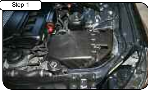
Step 1 Complete Stock Intake.