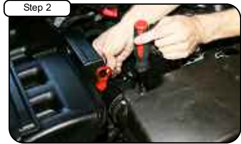
Step 2 Disconnect MAF sensor. Loosen clamp on air box.