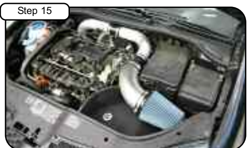
Note: Place enclosed CARB EO sticker on a clean/smooth surface on or near the intake system. EO identification label is required in passing the smog check inspection. Retighten all connections after approximately 100-200 miles. Your installation is now complete. Check all clamps and hoses periodically. Thank you for choosing aFe!