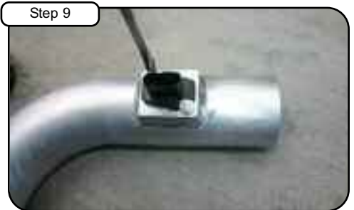
Install MAF sensor into new tube with screws provided and tighten using flat head screwdriver.