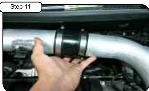
Place 2-3/4" x 3" straight coupler onto other 90 degree tube and install. Do not tighten.