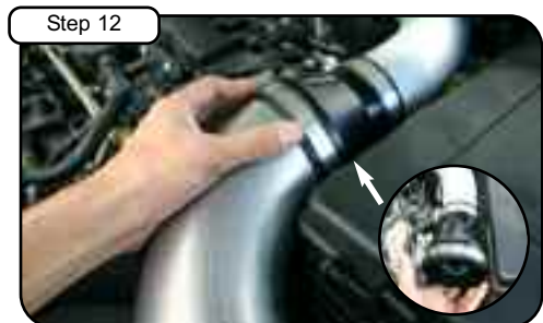
Place 2-3/4" x 4" reducer coupler on 2-3/4" tube side. Place 4" 90 degree tube onto 4" coupler side. Guide tab on 4" tube into isolation mount.