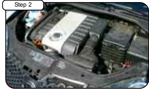
Complete stock intake.