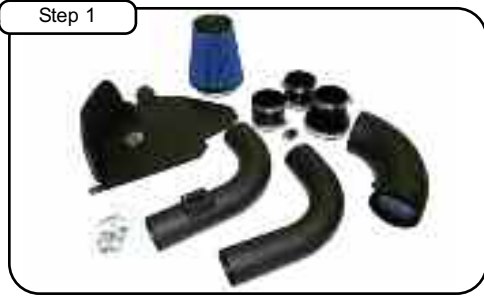
Complete kit with parts.

P.O. Box 1719 Corona, CA 92878 Support: 951-493-7100 www.aFeilters.com