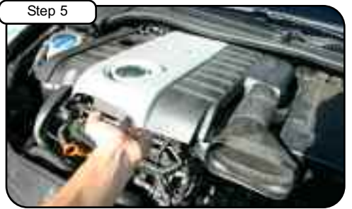
Carefully grab engine cover firmly, pull up and remove. (This may require some force)