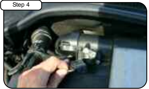
Disconnect the MAF harness and unclip the two clips holding in OE intake tube. Pull away OE tube from engine cover.