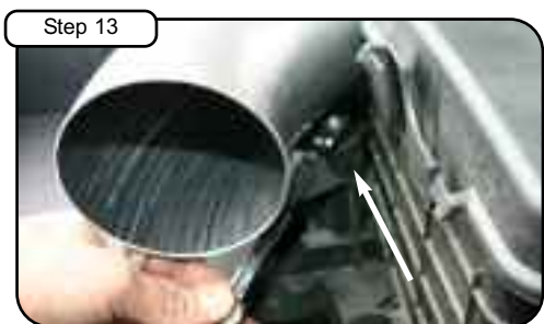
Tighten Isolation mount with M6 nut and washer provided. Make sure tab is on isolation mount. Adjust height and tighten all clamps on intake tubes with 5/16" nut driver.