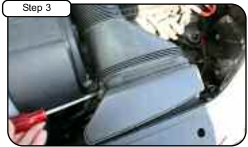
With T-20 torx bit, loosen the 2 bolts that hold in OE intake ram air unit and pull away.