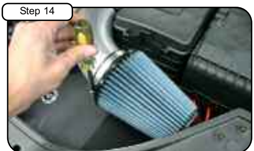
Install Air Filter and tighten using 5/16" nut driver. ( To ensure filter is engaged properly, mark a line 1" from the end of the tube, position filter flange at line and tighten clamp ).