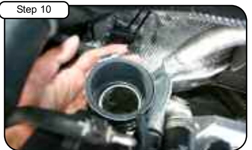
Place 2-1/2" coupler side onto turbo with clamps provided and tighten. (Make sure 2-3/4" side is facing up) Install intake tube from step 9.