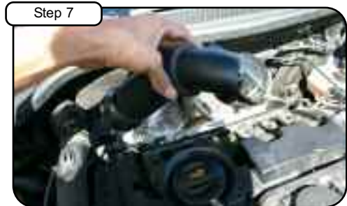
With pliers or channel locks, remove clamp off OE intake tube and remove from turbo. Also make sure OE turbo coupler is removed.