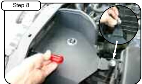
Install trim seal to housing and place into vehicle. Tighten using screws from step 6. Use provided M6 isolation mount to tighten housing down in front of battery.