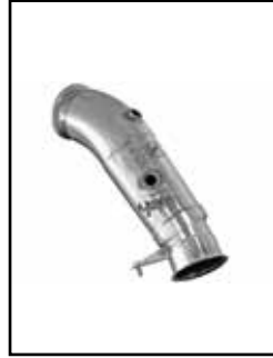
Twisted Steel Header