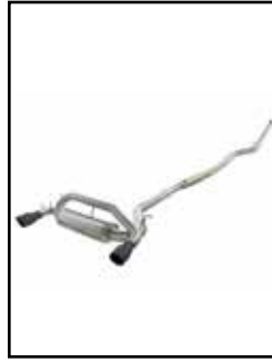
304 SS Cat-Back Exhaust