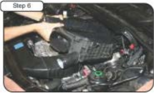
Step 6 Remove complete air box from vehicle.