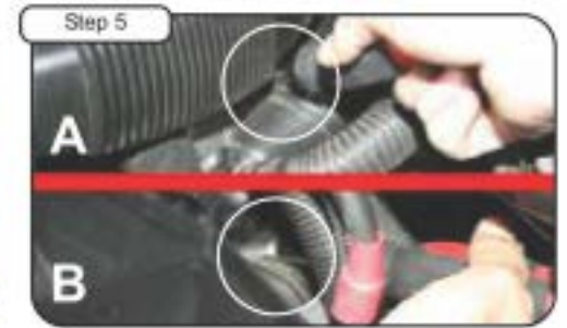
Step 5 A) Loosen clamp closest to the radiator with 1/4" nut driver. B) Loosen clamp closest to fire wall with 1/4" nut driver. Leave clamps in position.