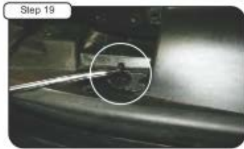
Step 19 With flat head screwdriver, carefully pry and push up plastic pin.