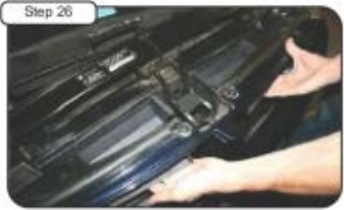
Step 26 For easier installation, the next three steps will require an assistant. Have person A hold the scoops in position as shown.