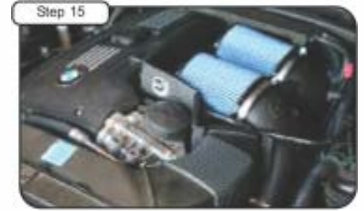
Step 15 Your Intake installation is now complete. Please check all clamps and hoses periodically and tighten.

Continue to page 2 for D.A.S. Installation. →