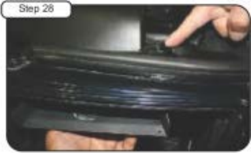
Step 28 Detail of properly installed plastic pin clips. Make sure pin clips are through hole on scoops allowing to secure and hold in place!