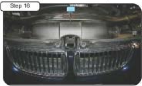
Step 16 Complete Stock Configuration.