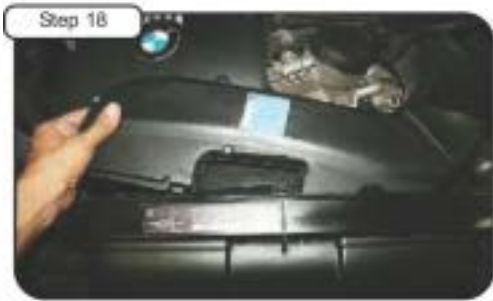
Step 18 Pull back ram air duct and remove.