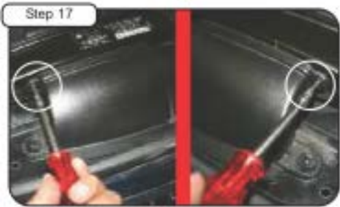
Step 17 Remove screws on ram air duct using T25 torx bit. (Save for later installation)