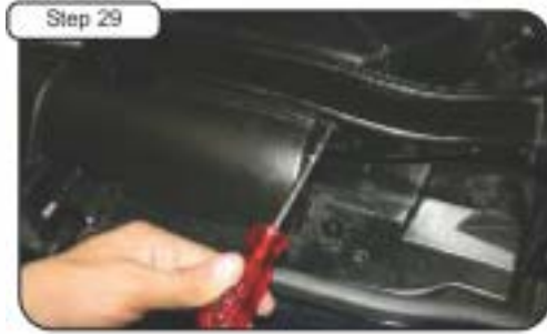
Step 29 Re-position ram air duct from step 3. Secure using the 2 screws from step 17 and tighten using T25 torx bit.