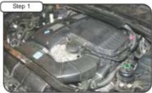
Step 1 Complete Stock Intake.