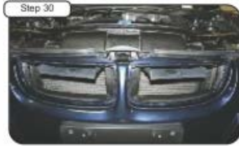
Step 30 Your completed D.A.S. installation will look like this. Check and make sure they are secure. Re-install grills by lining up tabs and pushing them in until they snap into place.

NOTE: Place enclosed CARB EO sticker on or near the device on a smooth, clean surface. EO identification label is required to pass the smog test inspection.