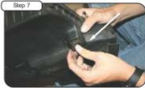
Step 7 Remove the 3 rubber grommets from the air box. (To be used in step 9.)