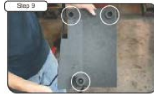
Step 9 Install rubber grommets from step 7 on new housing.