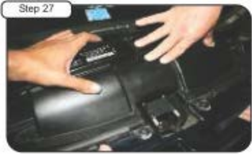
Step 27 Have person B re-install the cover and secure with plastic pin clips that were removed earlier. (See steps 19-21)