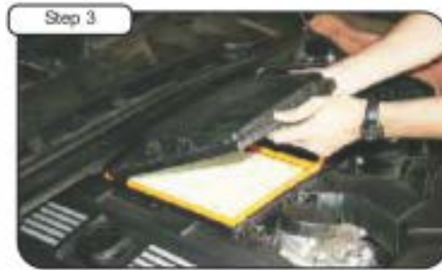
Step 3 Unclip upper half of air box to remove lid and filter.