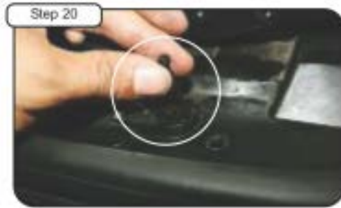
Step 20 Remove plastic pin.