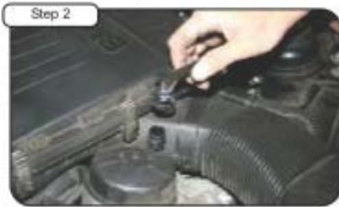
Step 2 Disconnect vacuum line and pull back.