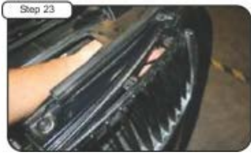
Step 23 The grills are held in place with push clips. To remove, reach in behind each grill and push forward while using other hand to support grill from the front.