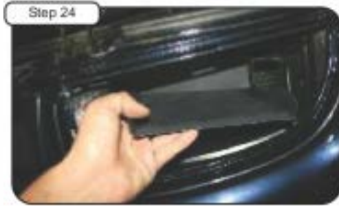
Step 24 Install 05-01016 Driver side D.A.S.