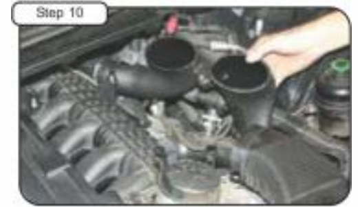
Step 10 Install new tube into vehicle and pull back towards driver fender. Do not tighten clamps.