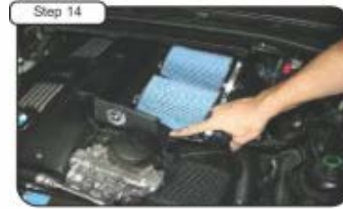
Step 14 Install air filters and tighten with 5/16" nut driver and connect vacuum line.