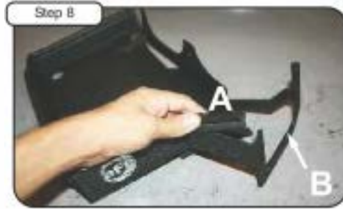
Step 8 A) Attach 7/16" trim seal to top of housing. B) Attach rubber edge trim seal to ram air cut out on housing.