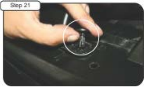
Step 21 Remove plastic clip. Repeat steps 19-21 for remaining clip. (Save for later installation)