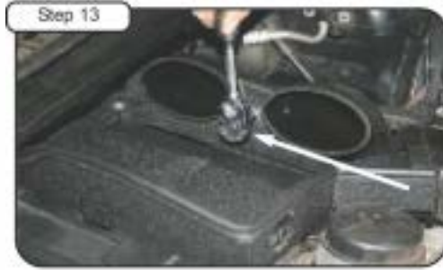
Step 13 Install screw, washer and wavy washer provided, and tighten with 10mm socket or wrench. Tighten clamps to tube with 1/4" nut driver.