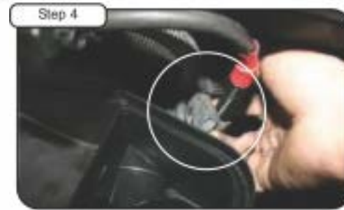
Step 4 Pull back rubber mount attached to battery cable. Use pliers if necessary. This will allow stock clamp to be loosened. (To be done in step 5B.)