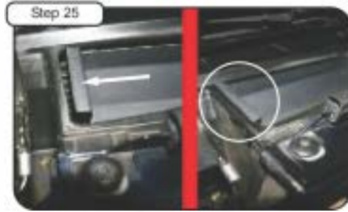
Step 25 Position scoop tab on plastic support as shown. (Repeat for 05-01017 Passenger side D.A.S.)