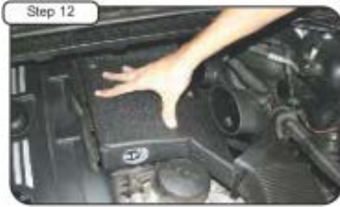
Step 12 Push down housing allowing grommets to seat. Align threaded insert with hole on housing.