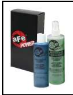
Pro 5R Restore Kit