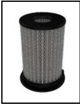
Pro DRY S Air Filter