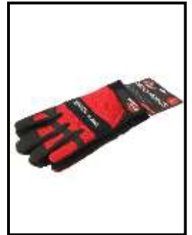
Mechanic Gloves (L)