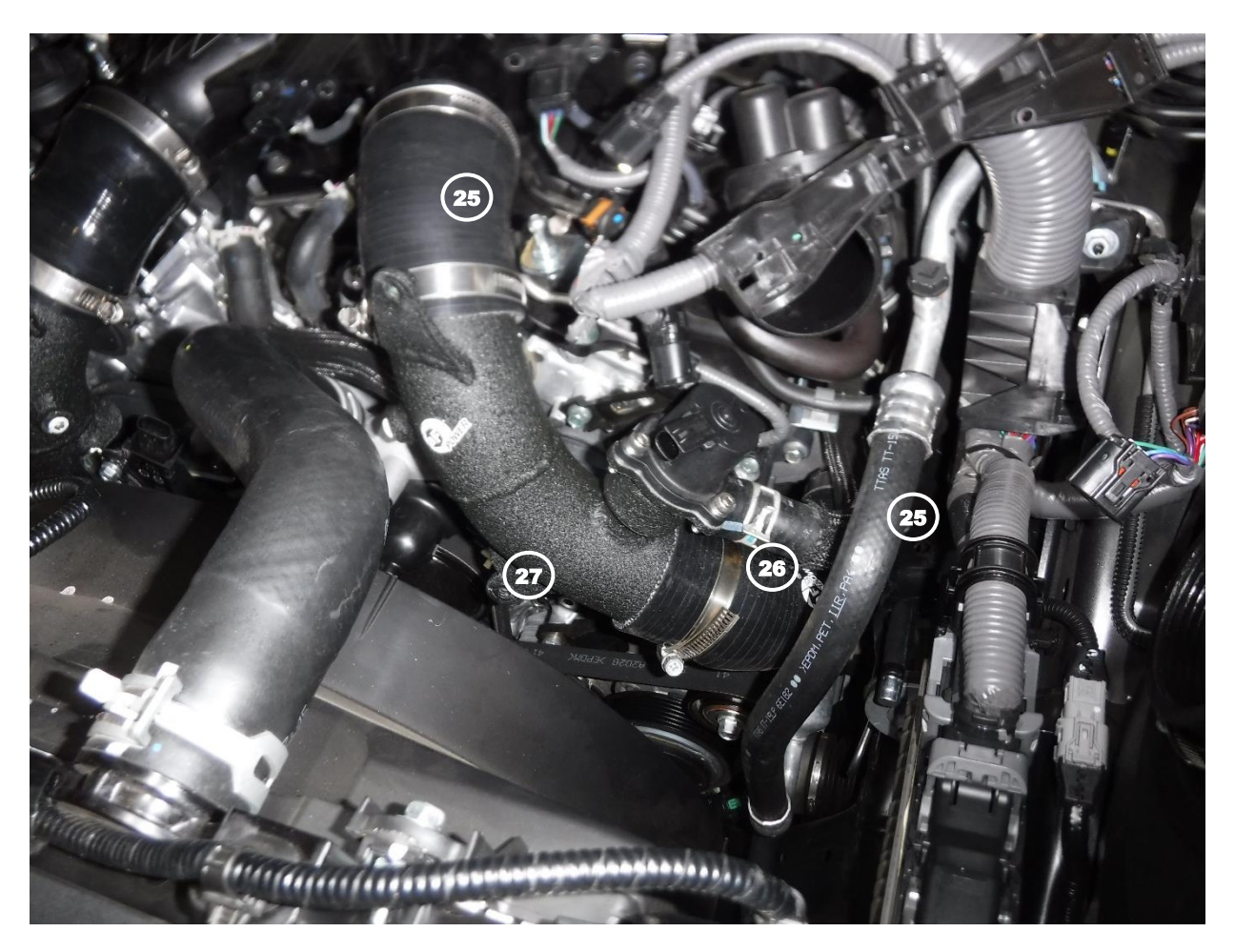
Note: Be sure to thoroughly clean all oil residue off of the connections before installing any of the aFe couplings onto the vehicle.