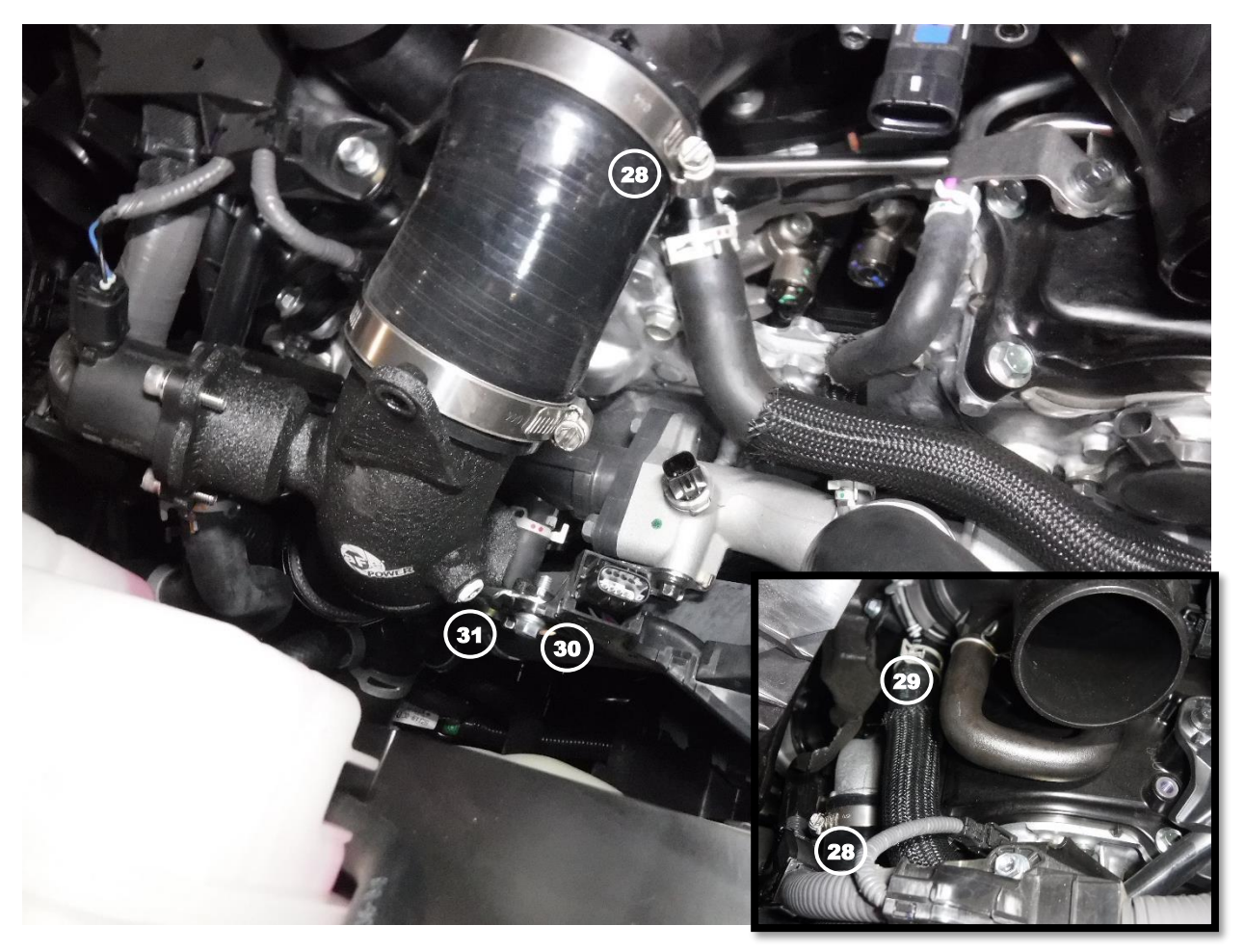
Note: Be sure to thoroughly clean all oil residue off of the connections before installing any of the aFe couplings onto the vehicle.