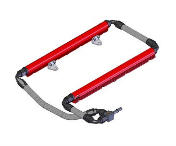
Example of a returnless fuel system plumbing