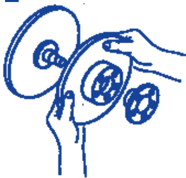
Mount to clean rust free flanges