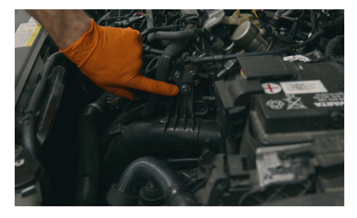
9. Using a 7mm socket or flathead screwdriver, loosen the stock hose clamps securing the coupler between the turbocharger and the stock hot side pipe and remove the coupler from the vehicle.

8. Using a T30 Torx bit, unbolt the bolt securing the stock hot side pipe to the bracket on the upper part of the engine. This is a captive bolt and will remain attached to the pipe.