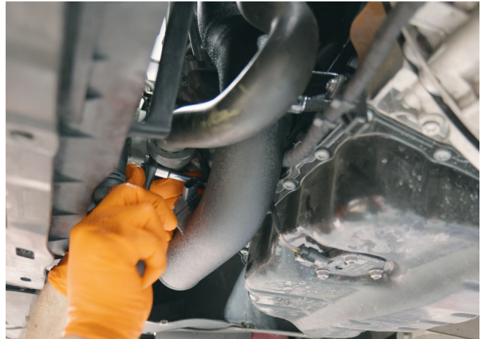
11. Unplug the connector from the MAP sensor on the stock cold side pipe by pulling out the lock and depressing the clip on the connector.