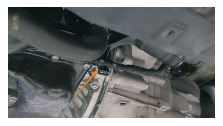
4. Using panel clip pliers or a flathead screwdriver, remove the tree clip holding the hose to the stock hot side pipe.

3. Remove the clip holding the wiring harness to the stock hot side pipe by depressing the button on the back with a pick tool and sliding the clip off the bracket.