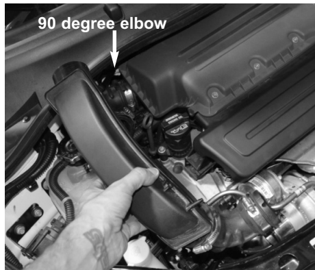
Loosen clamp on turbo. Loosen clamp on the 90 degree elbow. Disconnect the vacuum line using pliers. Remove the factory intake tube.