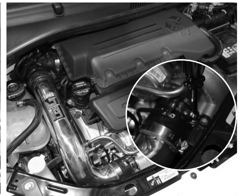
Install the step hose to the turbo with clamps. Tighten the clamp on turbo only. Install new intake tube and position intake tube to factory 90 degree elbow and turbo. Position best fit and tighten. Re-connect vacuum line and secure. Congratulations! You have just completed the installation of this intake system. Periodically, check the alignment of the intake, normal wear and tear can cause nuts and bolts to come loose. Note: Check clearance and adjust if needed! Failure to check the alignment and adjust the intake can cause damage that will void the warranty. Injen Technology is not responsible for any damages caused by/from improper installation.