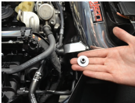
21. Bolt down the intake tube using the provided M6 nuts and washers.