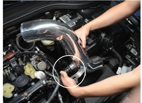
18. Connect the secondary air injection tube to the injen intake tube.