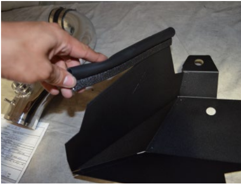
13. Install the 10" bulb trim onto the top edge of the heatshield. Trim the bulb trim if necessary.