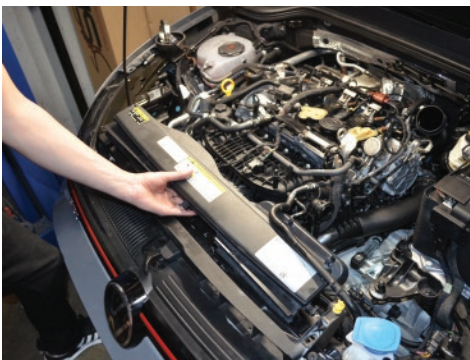
10. Re install the front scoop and secure using the two OEM screws.