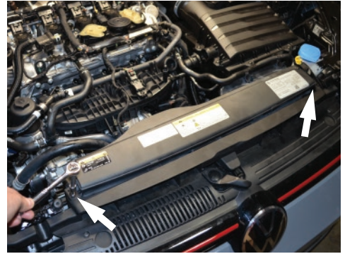
6. Remove the two screws holding the front air scoop.