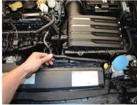
5. Detach the coolant line from the front scoop.