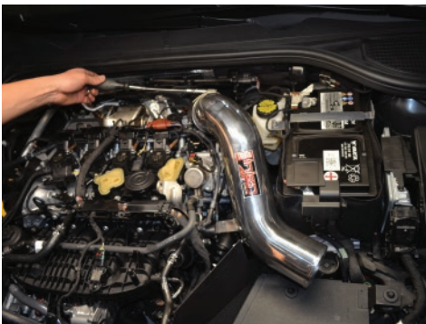
20. Install the intake tube and line up the bracket to the M6 Vibra mount.