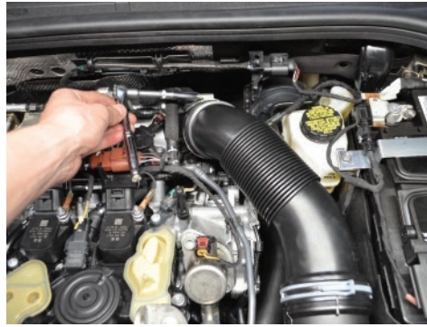
2. Loosen the clamp holding the stock intake tube to the turbo inlet.