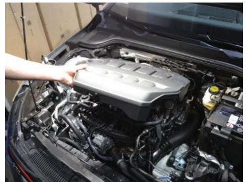
9. Remove the engine cover from the engine bay.