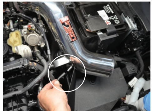
22. Connect the vacuum line to the intake tube.