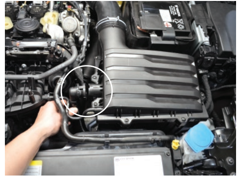
3. Squeeze the retaining tabs on the secondary air injection tube and pull away from the air box.