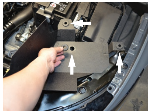
12. Install the three grommets to the heatshield.