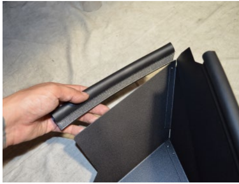
14. Install the 9.5" bulb trim onto the front edge of the heat shield. Trim the bulb trim if necessary.