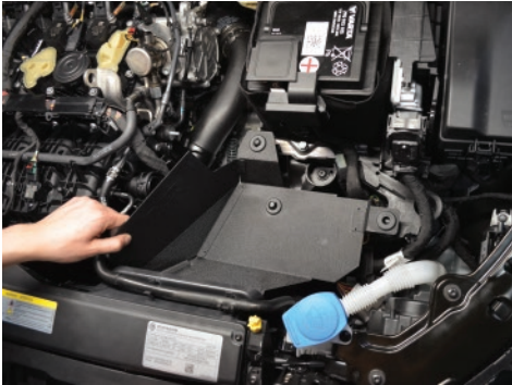
16. Install the heatshield into the engine bay. Push down on grommets until they are fully secured.