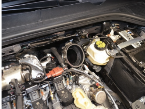
17. Install the step hose onto the turbo inlet. Attach both clamps onto the hose and secure the turbo side clamp.