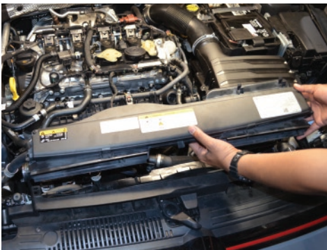
7. Remove the front scoop from the engine bay.