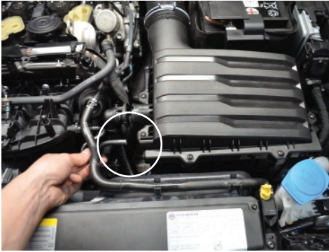
4. Remove small vacuum line from the air box.