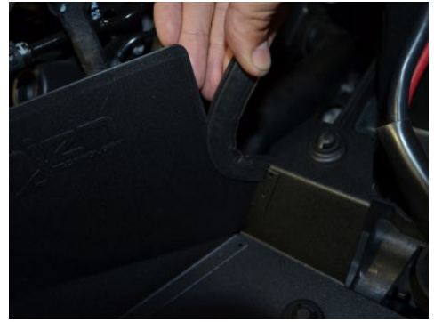
15. Install the 5" bulb trim onto the side edge of the heatshield. Trim the bulb trim if necessary.