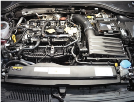
1. Stock intake system.