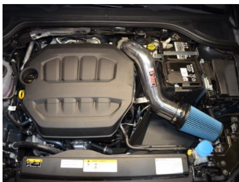
24. Ensure that all bolts, clamps and hoses are properly secured. Re install the engine cover.

CONGRATULATIONS! You have just completed the installation of this intake system. Periodically, check the alignment of the intake, normal wear and tear can cause nuts and bolts to come loose. Note: Check clearance and adjust if needed! Failure to check the alignment and adjust the intake can cause damage that will void the warranty. Injen Technology is not responsible for any damages caused by/from improper installation.