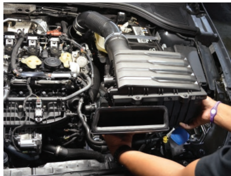
8. Remove the intake assembly from the engine bay. Note: Grommets are attached to the air box, apply lubricant if necessary.