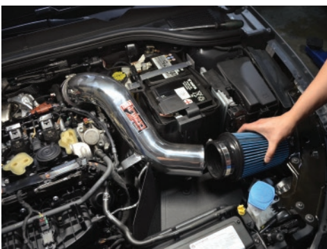
23. Install the air filter to the intake tube and secure using the provided clamp.