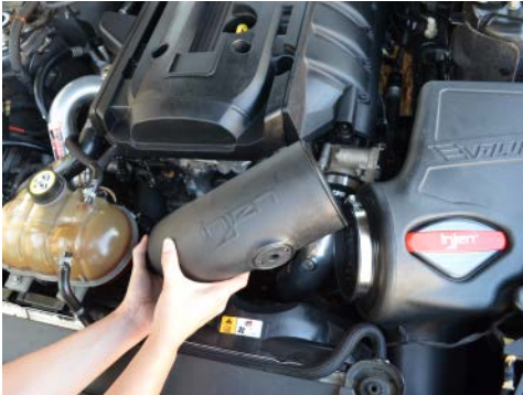
16. Lower the injen intake tube into the engine bay.