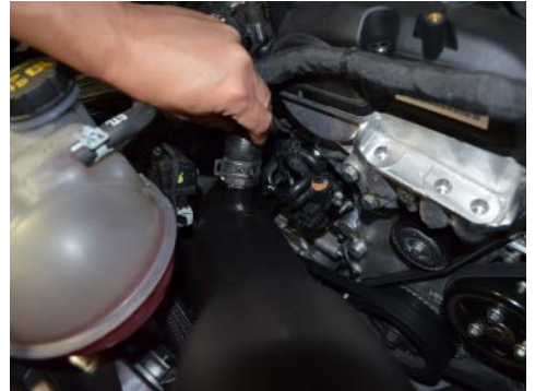
18. Connect the diverter valve return line to the injen intake tube. Then secure it using the OEM tension clamp.