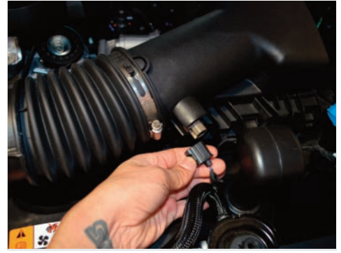
3. Disconnect the IAT sensor harness. Then twist the IAT sensor to remove it from the air box.