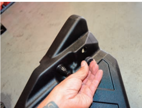
10. Install the smaller grommet and aluminum spacer from figure 8 into the injen air box.