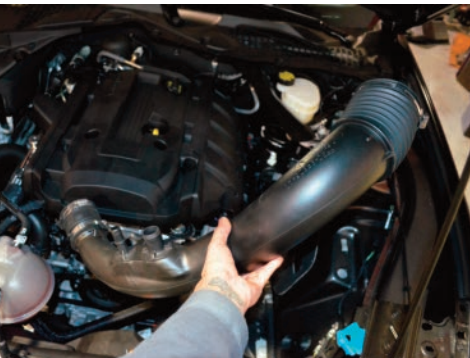
7. Loosen the clamp connecting the intake tube to the turbocharger. Then remove the intake tube.