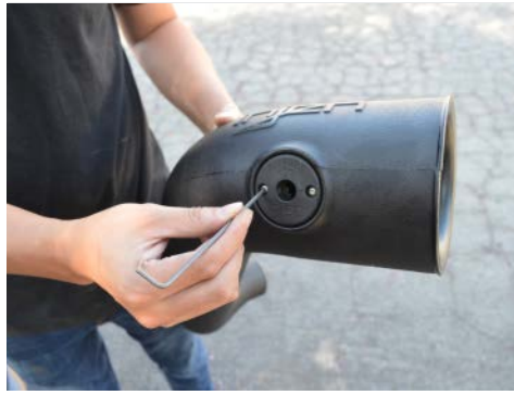
14. Place the air temp sensor adapter on the injen intake tube. Secure using the provided M4 bolts.