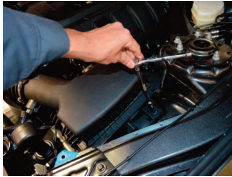
2. Remove the 10mm bolt from the side of the air box.