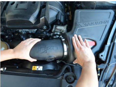
19. Insert the injen intake tube into the air filter.