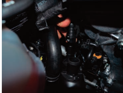
5. Slide the retaining clip on the crankcase line. Then disconnect the crankcase line from the intake tube.