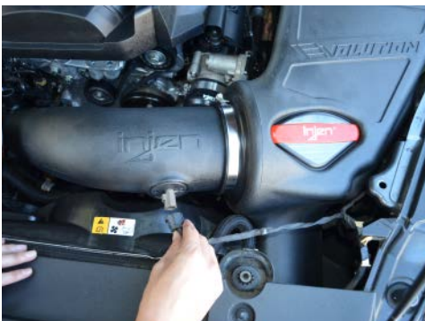
22. Reconnect the IAT sensor harness .