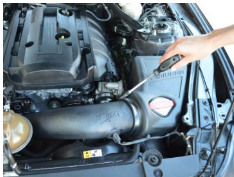
23. Secure all clamps on the intake system.

CONGRATULATIONS! You have just completed the installation of this intake system. Periodically, check the alignment of the intake, normal wear and tear can cause nuts and bolts to come loose. Note: Check clearance and adjust if needed! Failure to check the alignment and adjust the intake can cause damage that will void the warranty. Injen Technology is not responsible for any damages caused by/ from improper installation.