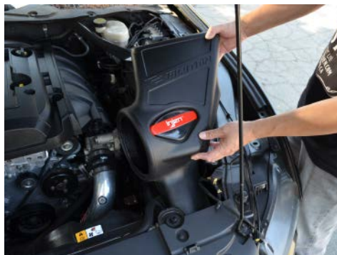
11. Install the injen air box into the engine bay.