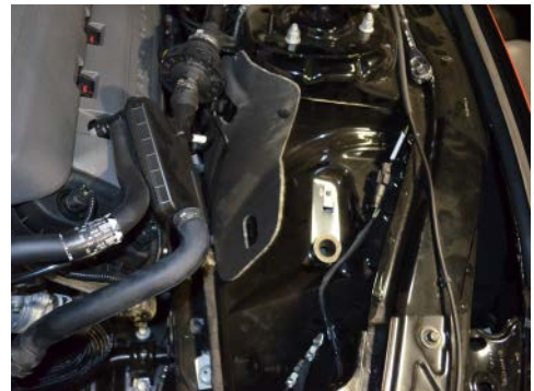
9. Install the larger grommet from figure 8 into its original hole location.