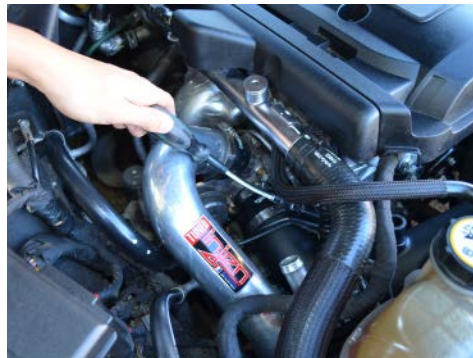
20. Insert the injen intake tube into the hump hose and secure the tube using the provided clamps.