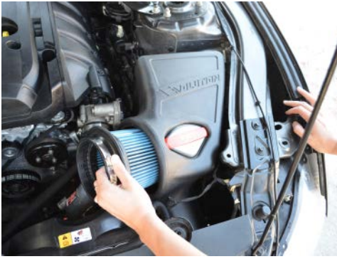
13. Install the filter into the air box. Once seated, Secure the twist lock filter by rotating in either direction 1/4" turn.