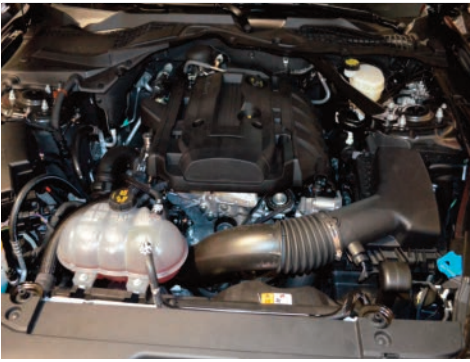
1. Stock intake system.