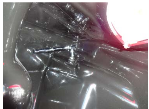
12. Through the filter inlet, secure the injen air box using the factory 10mm bolt.