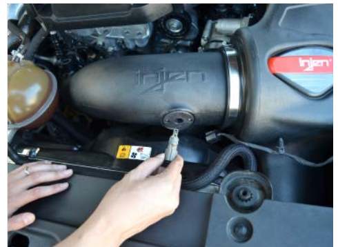
20. Install the IAT sensor into the air temp sensor adapter. Once full seated, twist the sensor to secure it.