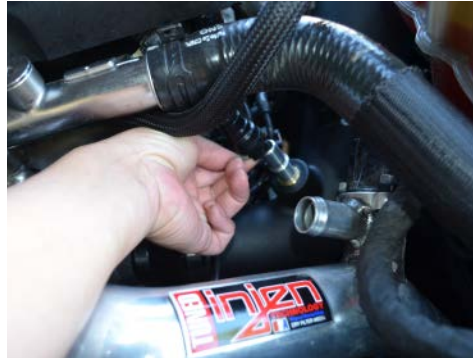
17. Connect the crank case line onto the machined fitting located on the injen tube