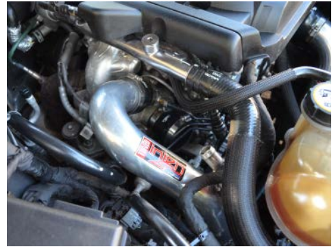
15. Install the 2.3875" - 3" hump hose onto the turbocharger and secure it using the provided clamps.