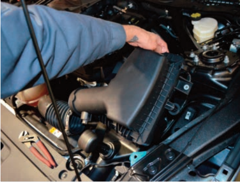
4. Loosen the clamp connecting the intake tube and air box. Then remove the air box from the engine bay.