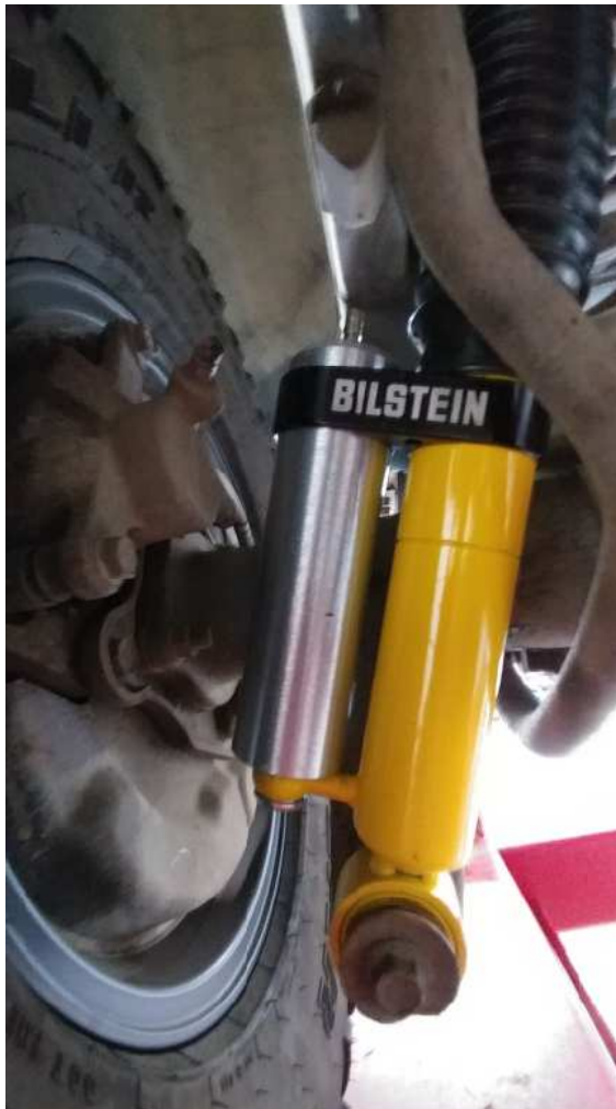
Figure 2 – RIGHT REAR