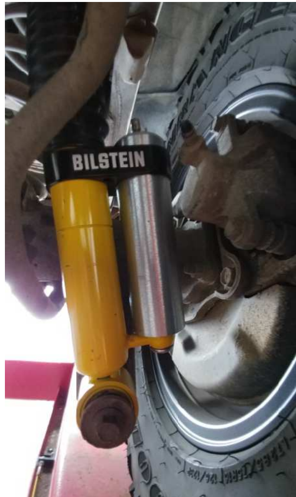
Figure 3 – LEFT REAR

Note: The shocks depicted herein differ slightly in appearance from the supplied components.