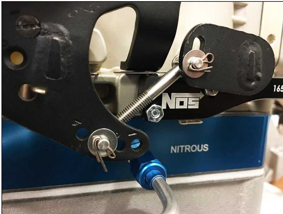
Figure 2 – Proper Microswitch Engagement at Wide Open Throttle