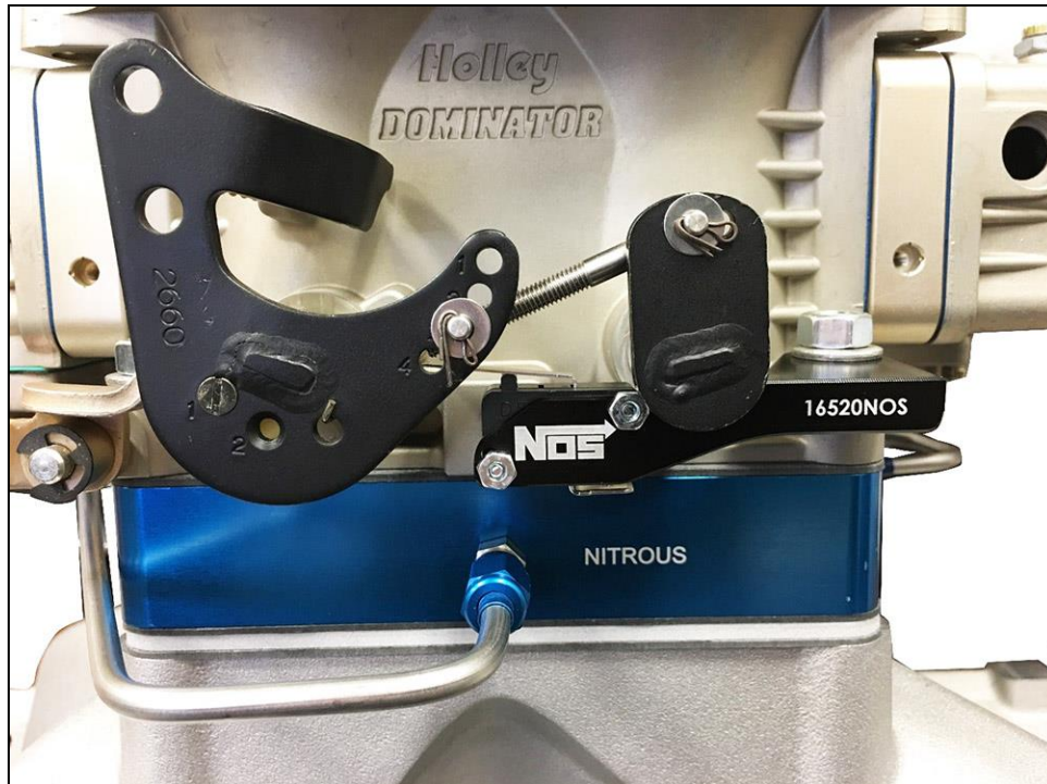
Figure 1 – Microswitch Bracket Placement

In your packaging, you will find the billet aluminum microswitch bracket, microswitch, and the mounting hardware for the microswitch. The 4500 series bracket typically installs on the driver's side rear carburetor stud ( Figure 1 ). Loosely install the microswitch to the bracket. Once installed, move the linkage to WOT (Wide Open Throttle) and adjust the microswitch to the desired engagement position. Tighten the carburetor nut and then the microswitch screws. Verify switch adjustment by moving the throttle linkage to WOT ensuring proper activation.