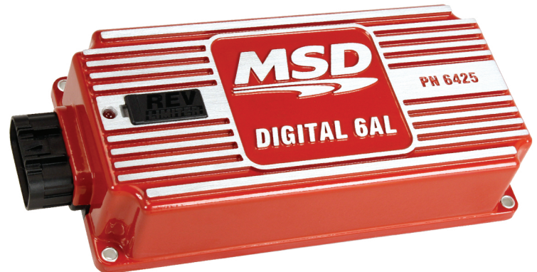
DIGITAL 6AL, PN 6425