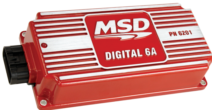
DIGITAL 6A, PN 6201

Wiring is the same as other MSD Ignitions while the single connector provides a cleaner installation.