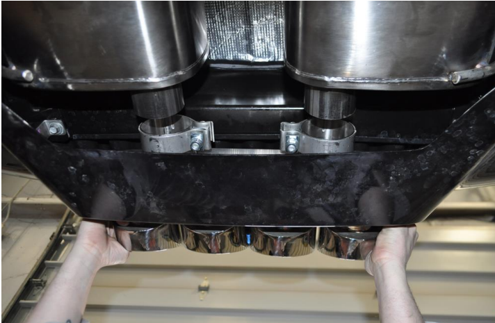
Fig. A Fig. B